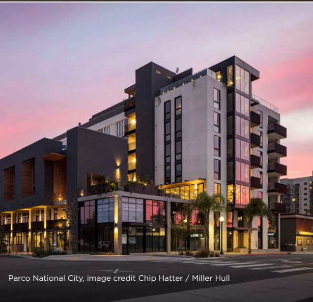
Parco National City, image credit Chip Hatter / Miller Hull

San Diego's largest, free, architectural festival, OH! San Diego, returns for its 7th season on March 18-20, 2022, opening the doors to explore a diverse mix of San Diego-area neighborhoods.