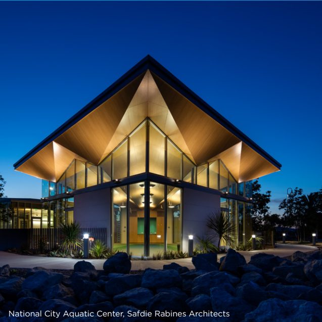
National City Aquatic Center, Safdie Rabines Architects