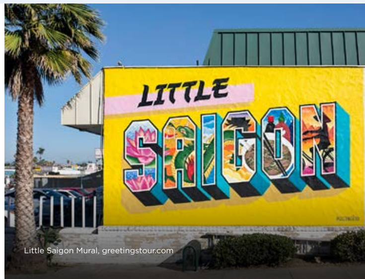
Little Saigon Mural

Please consider connecting your brand to OH! San Diego by becoming a sponsor. This year your support will make it possible for OH! to reach a broader, more diverse range of communities and help us adapt our programming to a virtual environment.