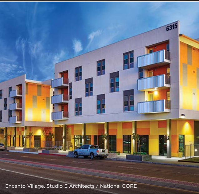
Encanto Village, Studio E Architects / National CORE