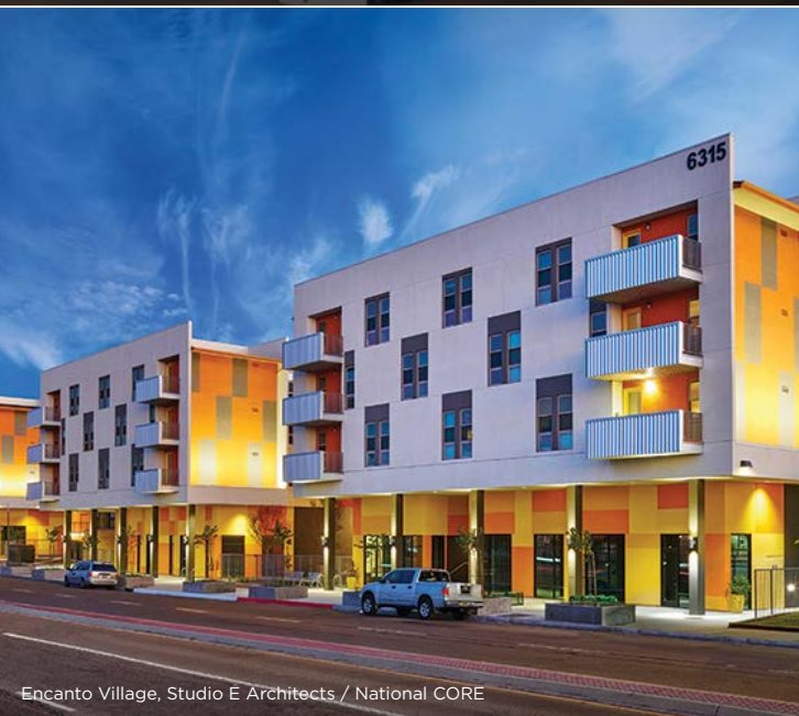
Encanto Village, Studio E Architects / National CORE