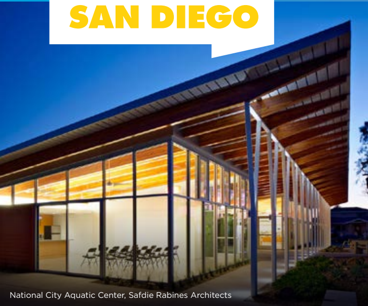
National City Aquatic Center, Safdie Rabines Architects