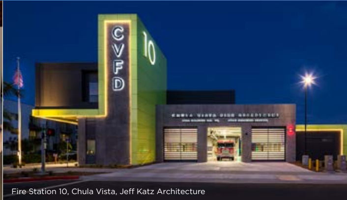
Fire Station 10, Chula Vista, Jeff Katz Architecture