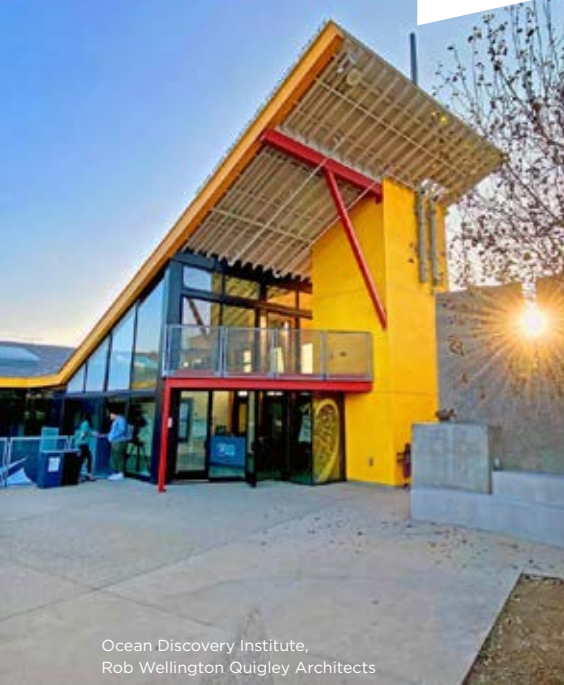
Ocean Discovery Institute, Rob Wellington Quigley Architects