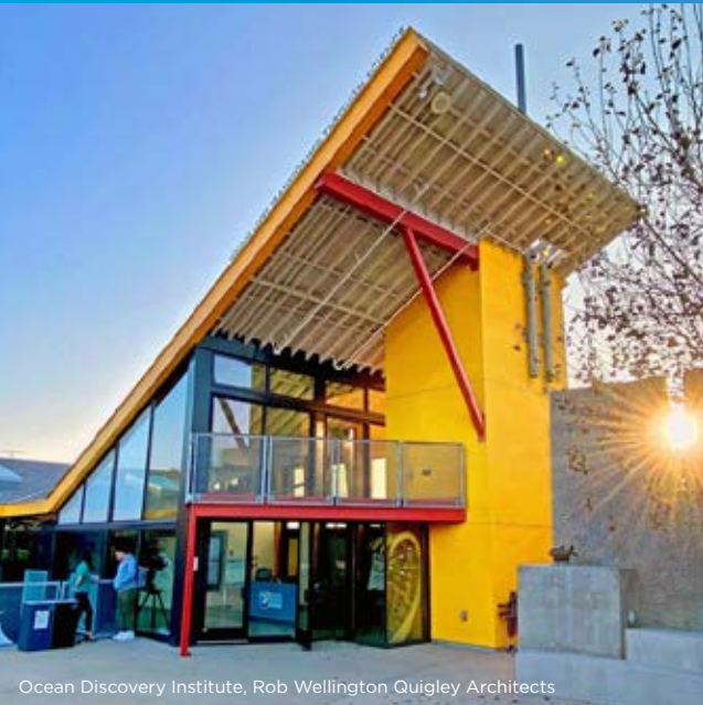
Ocean Discovery Institute, Rob Wellington Quigley Architects