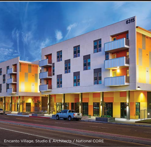
Encanto Village, Studio E Architects / National CORE

San Diego's largest, free, architectural festival, OH! San Diego, returns for its 6th season on March 5 - 12, 2021, opening the doors to explore a diverse mix of San Diego-area neighborhoods.