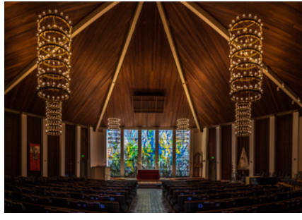
Oliver Asis | All Souls' Epsicopal Church