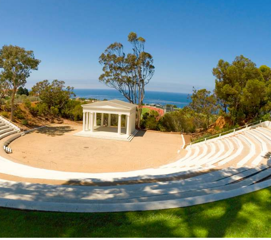
74 | Greek Amphitheatre at Point Loma Nazarene University