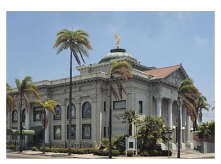
12 | The Abbey on Fifth