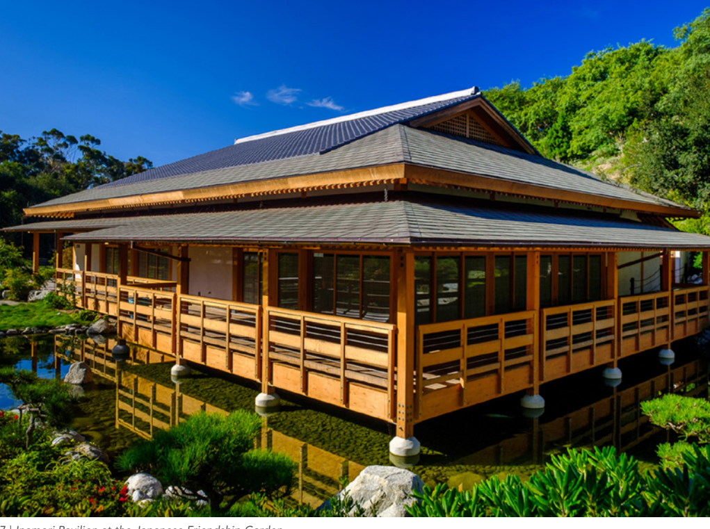
7 | Inamori Pavilion at the Japanese Friendship Garden

The largest cultural complex west of the Mississippi, Balboa Park is sometimes called "The Smithsonian of the West" for the impressive concentration of cultural institutions within its boundaries. Originally built for temporary use during the 1915–16 Panama-California Exposition, the buildings here are beautiful enough to be considered attractions in themselves. The real draw is the culture, history, science and arts held within their walls. Highlights include eight gardens, 15 museums, a Tony Award-winning theater and the San Diego Zoo.