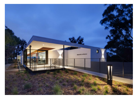
21 | domusstudio architecture

The 1960s-era building served as a medical office for over 50 years and eventually became a blight and blocked views from the neighborhood into Maple Canyon. Honoring the original architect's legacy and its mid-century bones, the building was transformed by adding expanses of glass and removing all interior walls to make it as transparent