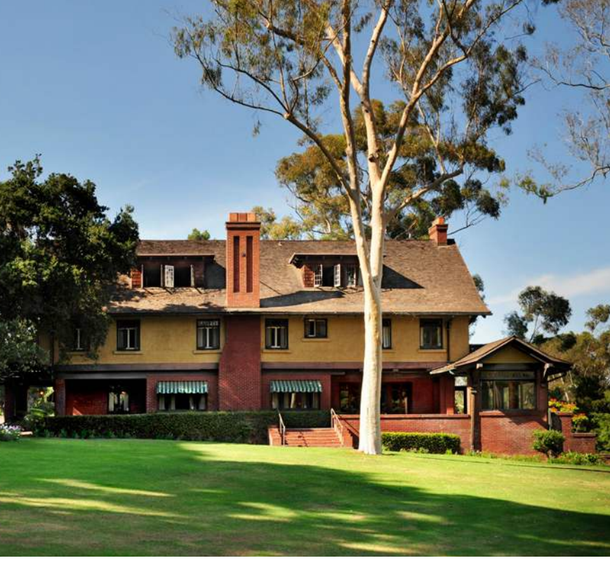
19 | Marston House Museum & Gardens

Visit the Bankers Hill hub to help plan your weekend and pick up your passport.