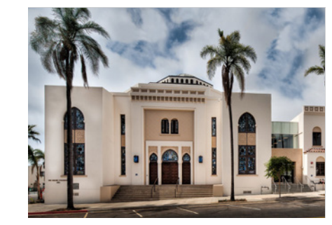
15 | Ohr Shalom Synagogue

Named after its reputation for being home to the affluent and their many mansions built in San Diego's heyday by some of its most notable architects including Irving Gill—Bankers Hill is located west of Balboa Park with easy access across the historic Cabrillo Bridge. It is a desirable residential location with bay views available from many new luxury high-rise condos.