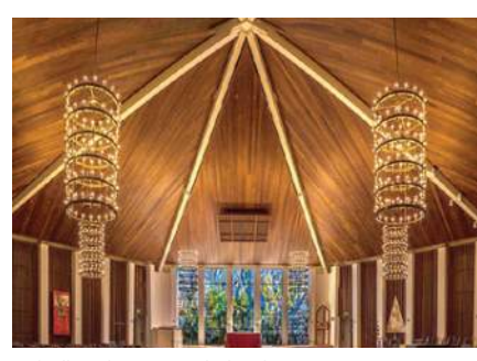
64 | All Souls' Episcopal Church