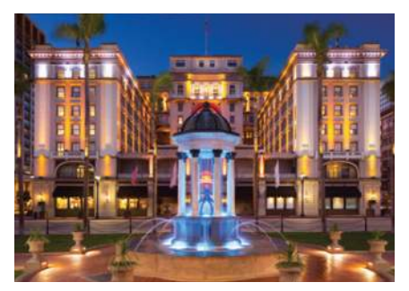
35 | The US Grant Hotel