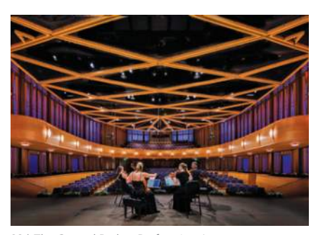
82 | The Conrad Prebys Performing Arts Center

Included in the tour are Gill's Craftsman remodel of Wisteria Cottage (1907-1909), the sites of Gill's St. James Episcopal Church and Ellen Browning Scripps' Moulton Villa II (1915), the strikingly Modernist La Jolla Women's Club (1912), Kautz Residence (1913) La Jolla Recreation Center (1915), Bishop's School (1910–1924) and the La Jolla Metabolic Clinic (1924). Included are the various landscapes designed by Kate Sessions that accompany Gill's architecture. Together, they create a harmonious unit that transports visitors back to 1915 La Jolla and the community's Bohemian roots.