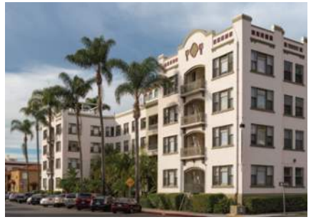
15 | The Barcelona

Now nearly a century old, The Barcelona was originally constructed as a full-service apartment-hotel, complete with a solarium, ballroom, restaurant and golf course. In its heyday, tourism directories listed it as the "Finest in the West." Today, it provides residents with modern systems and amenities, while maintaining its rich history and decorative Spanish Colonial architecture. Ride the historic elevator to the roof deck for panoramic views. Eugene Hoffman, 1921