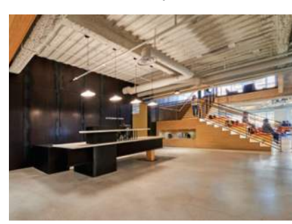
31 | Carrier Johnson + Culture