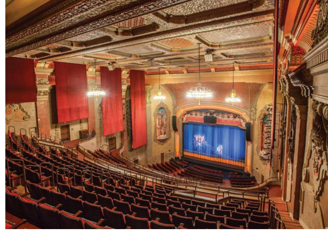
44 | Balboa Theatre

These 16 blocks with distinctive Victorian architecture are at the heart of historic downtown. A lively mix of bars, restaurants and nightclubs alongside offices, hotels and residences provide for a vibrant 24/7 lifestyle. This compact and diverse neighborhood is a walkable urban playground and entertainment destination.