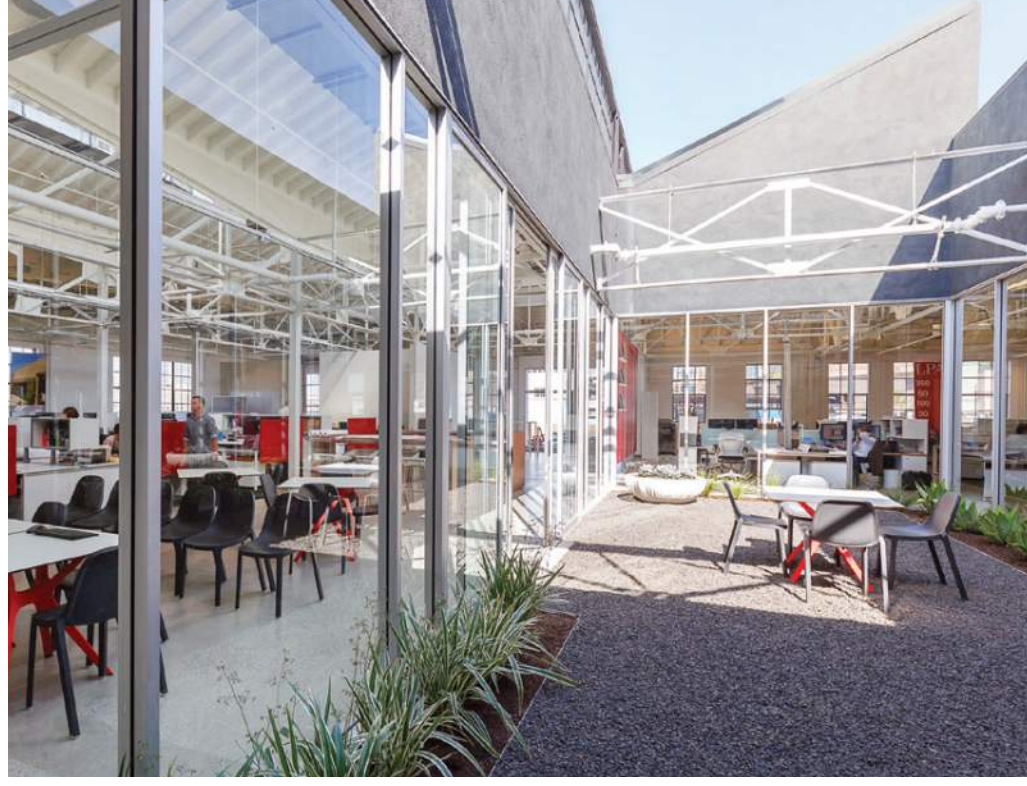
57 | LPA Design Studios

Dating back to the 19th century, Barrio Logan, recognized as Logan Heights, is one of the oldest neighborhoods in San Diego, with a long history honoring its working-class Chicano/Mexican-American community and culture. During the 1960s, the construction of Interstate 5 and the San Diego-Coronado Bridge dissected the community. Residents, refusing to be displaced, creatively adapted to city-imposed industrial rezoning, which has contributed to the area's unique mixed-use land pattern.