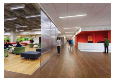
54 | E3 Civic High