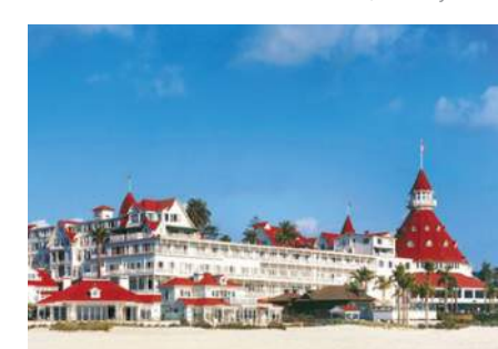
92 | Hotel Del Coronado