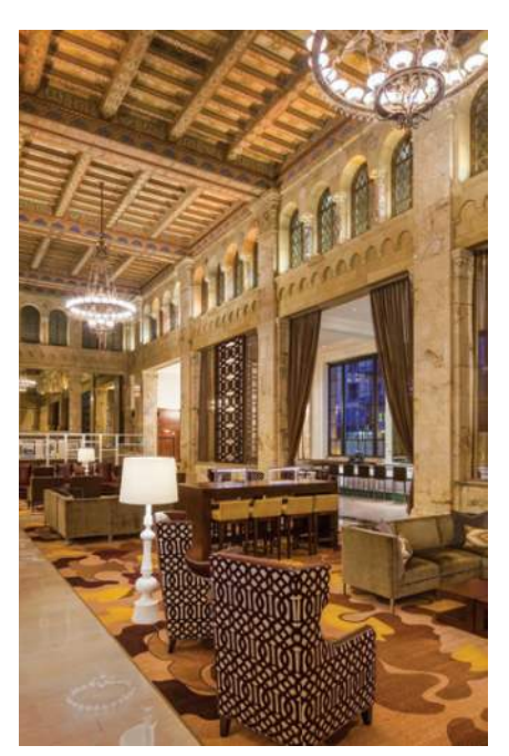
36 | Courtyard by Marriott