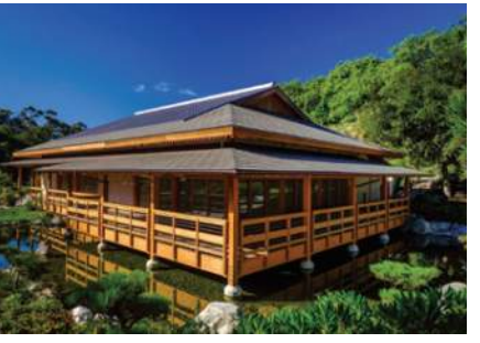
8 | Inamori Pavilion at the Japanese Friendship Garden