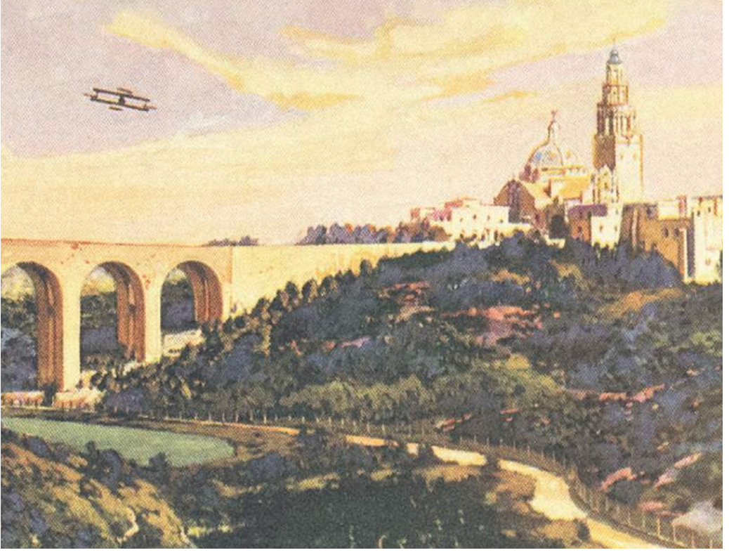
Balboa Park (1915)

The largest cultural complex west of the Mississippi, Balboa Park is sometimes called "The Smithsonian of the West" for the impressive concentration of cultural institutions within its boundaries. Originally built for temporary use during the 1915–16 Panama-California Exposition, the buildings here are beautiful enough to be considered attractions in themselves. The real draw is the culture, history, science and arts held within their walls. Highlights include eight gardens, 15 museums, a Tony Award-winning theater and the San Diego Zoo.