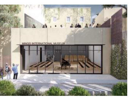
5 | Mingei International Museum (Artist Rendering)

Originally built as the House of Charm for the 1915 Panama-California Exposition, the Mingei has embarked on a major transformation of its mission-style building. This already award-winning project is now under construction with completion scheduled for 2021. Designed by local firm Luce et Studio,