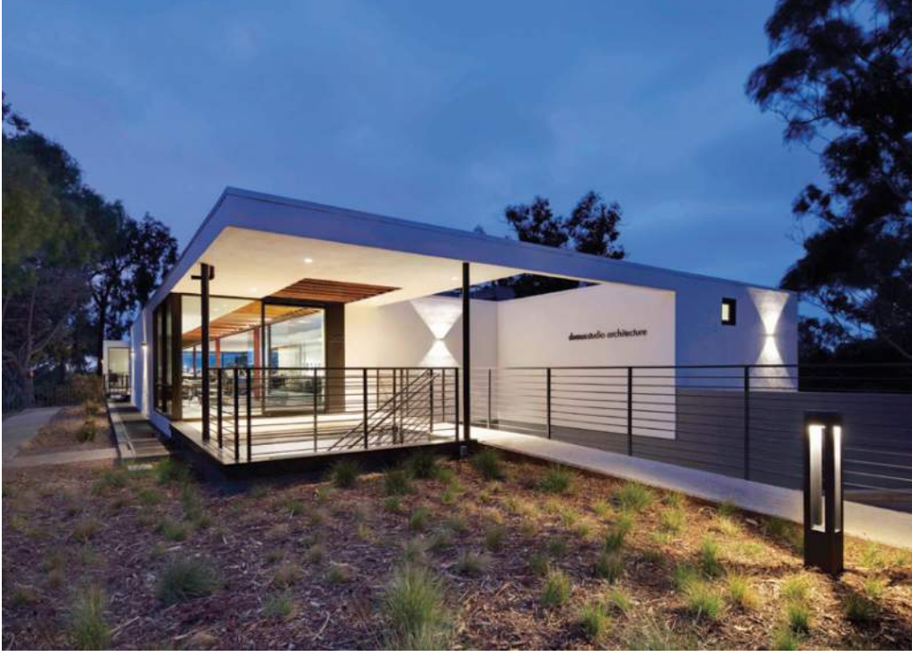
19 I domusstudio architecture

Named after its reputation for being home to the affluent and their many mansions built in San Diego's heyday by some of its most notable architects—including Irving Gill—Bankers Hill is located west of Balboa Park with easy access across the historic Cabrillo Bridge. It is a desirable residential location with bay views available from many new luxury high-rise condos.