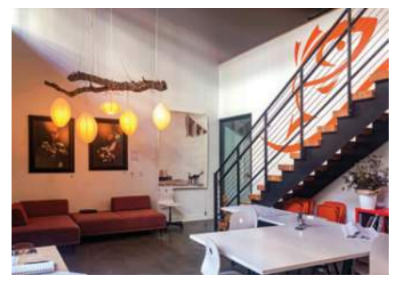
53 | LC Fisher Architecture at IDEA1 Apartments

Here is our nation's first example of a high school within a library! Its design complements the school's mission to teach students to be innovators, problem solvers and communicators and to encourage civic engagement. With its movable glass walls, modular furniture, demonstration kitchen and break-out learning spaces, e3 is wellequipped for its experiential, project-based curriculum. LPA Design Studio, 2013