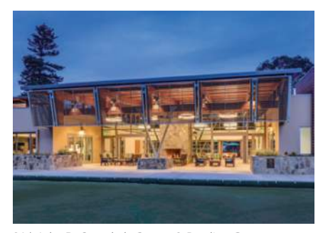
86 | John D. Spreckels Center & Bowling Green

This 9,000-square-foot, LEED Silver-certified building reflects an intensive public planning process to determine the elements of a facility that would serve Coronado's vibrant 50-year-old+ citizens well into the future. The "Pavilion in the Park" engages Spreckels Park on one side and the lawn bowling