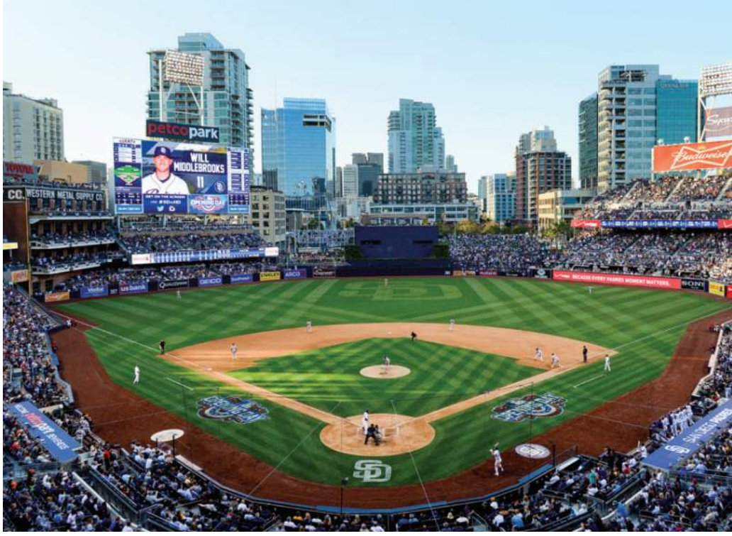
49 | Petco Park

Downtown's largest and fastest-growing neighborhood is in transition from a former warehouse district to an eclectic, thriving enclave. Repurposed brick warehouses stand side-by-side with modern mixed-use developments. Filled with energy, arts and innovation, East Village is fast becoming San Diego's next great neighborhood.