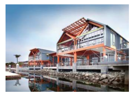
69 | The Miller Hull Partnership

to take advantage of the cool marine air and reduce energy loads. The interior is finished with healthy, sustainable materials and is filled with daylight and beautiful views of the marina. Miller Hull Partnership, 2009