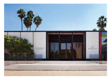
1 | Timken Museum of Art