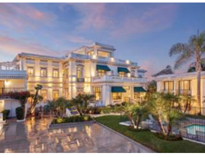
90 | Glorietta Bay Inn

Originally operated as a boarding house for students at the nearby School of Aviation run by aviation pioneer Glenn Curtiss, the structure fell into disrepair for decades. In 2005, the new owners embarked on an extensive renovation transforming this eyesore into a luxury bed and breakfast inn. Its historic character was maintained, with iconic architectural elements such as the hipped roof with dormers and the Craftsman