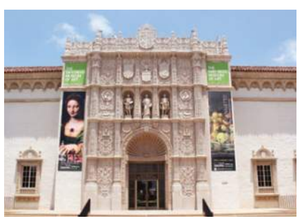
2 | San Diego Museum of Art

Considered to be one of the most important examples of mid-century southern California modernism, the Timken is known for the quality of the natural light illuminating its six intimately scaled galleries. In contrast to other Balboa Park structures, the building, constructed of travertine, bronze and glass, embraces the park beyond its walls by creating a light and airy "see-through" museum that blurs the boundaries between interior and exterior. John Mock, 1965