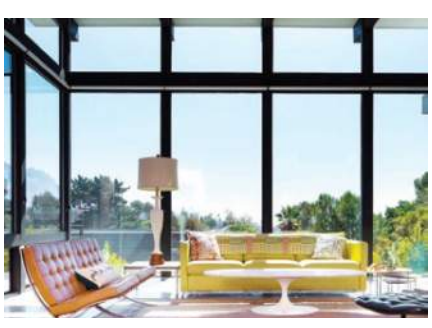
21 | Shayan House

The 1960s-era building served as a medical office for more than 50 years and eventually became a blight and blocked views from the neighborhood into Maple Canyon. Honoring the original architect's legacy and its mid-century bones, the building was