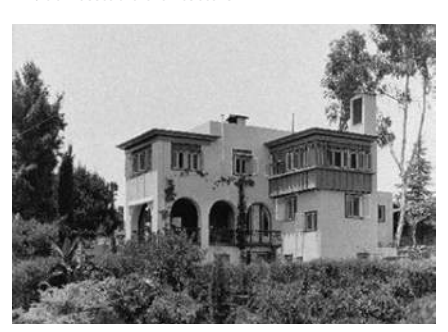
17 | Albatross Street Walking Tour (Teats House)