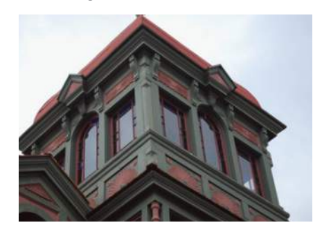
62 | Villa Montezuma Museum