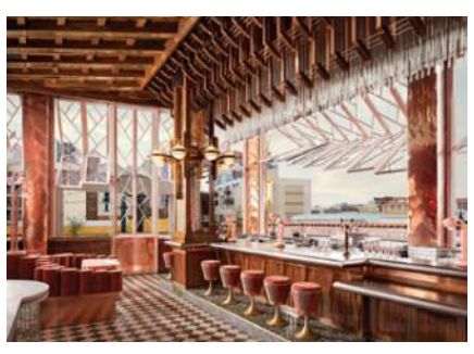
25 | Morning Glory