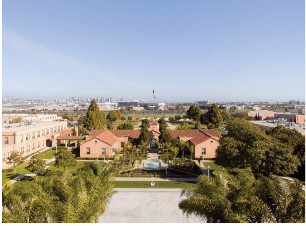
68 | Arts District Liberty Station

Situated on a peninsula with breathtaking views of San Diego Bay and the Pacific Ocean, Point Loma reflects many rich and deep histories: a close-knit Portuguese community; Juan Rodriguez Cabrillo's famous 1542 landing site; America's Cup Harbor and yacht clubs; Marine Corps Recruit Depot, the former Naval Training Center, now Liberty Station; Fort Rosecrans; the Naval Base: and the world-famous Cabrillo National Monument.